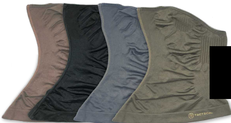
Tan Black Grey Olive